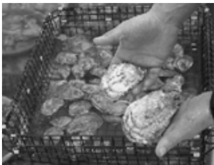
Selective breeding of oysters is only one of many topics discussed at annual WERA099 meetings.

The initiation of WCC099 occurred due to greater national and international interest in molluscan shellfish breeding programs and genetics in the early 1990's. On the mid-Atlantic Coast, USA, populations of the Eastern oyster continued to decline and established breeding programs to develop Haplosporidium nelsoni (MSX)-resistant Eastern oysters were revised and extended to include resistance to Dermo ( Perkinus marinus ). The collapse of the Chesapeake Bay oyster fishery also resulted in considerable debate on the best strategies for restoring oyster populations and these debates are still vigorous and ongoing. On the West Coast, USDA-WRAC (Western Regional Aquaculture Center) funded a long-term project on cross-breeding Pacific oysters to improve broodstock. Plans were also in place to start The Molluscan Broodstock Program (MBP) as a selection program for improvement of Pacific oysters. WCC and WERA meetings have been very important in developing these breeding programs. In addition, the contributions of French participants have greatly increased our understanding of summer mortality of Pacific oysters and have resulted in several US-French collaborative projects. Since the WRAC cross-breeding and MBP projects were established, Pacific oyster breeding programs have been established in Australia and New Zealand. International researchers from these countries have participated in the meetings and brought new perspectives and ideas.