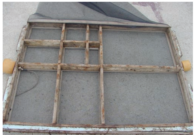
Wooden trays used in the “container size” experiment.