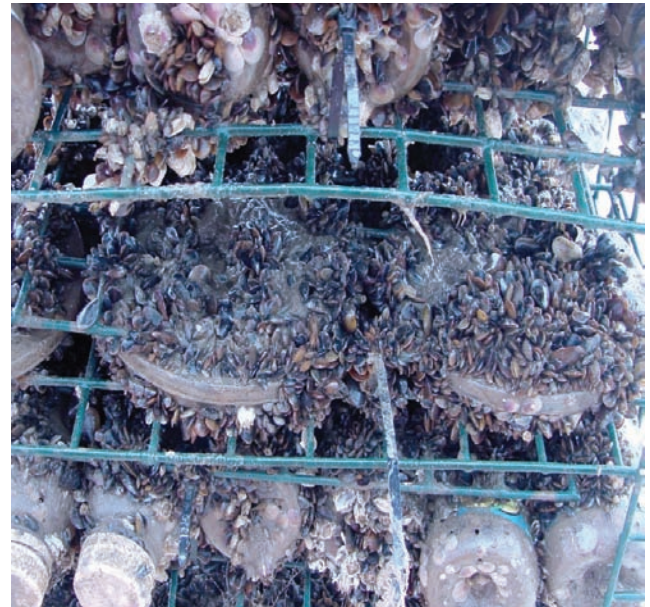
After 400 days in the ocean, the enclosures holding the juvenile lobsters are highly fouled, providing shelter and food...

A thought occurred to him. Maybe a lobster grew to the size of their container – like a goldfish. The next year he partitioned wooden trays into different size containers.