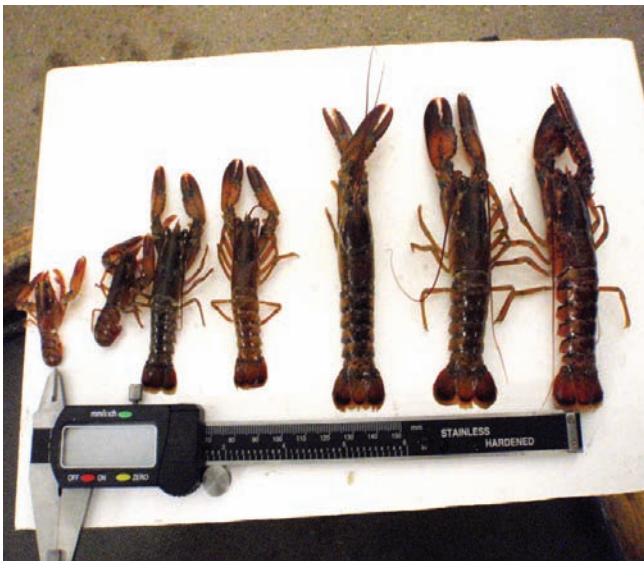
Lobsters from the “container size” experiment....those on the right coming from the larger sized containers and those on the left from the smallest.