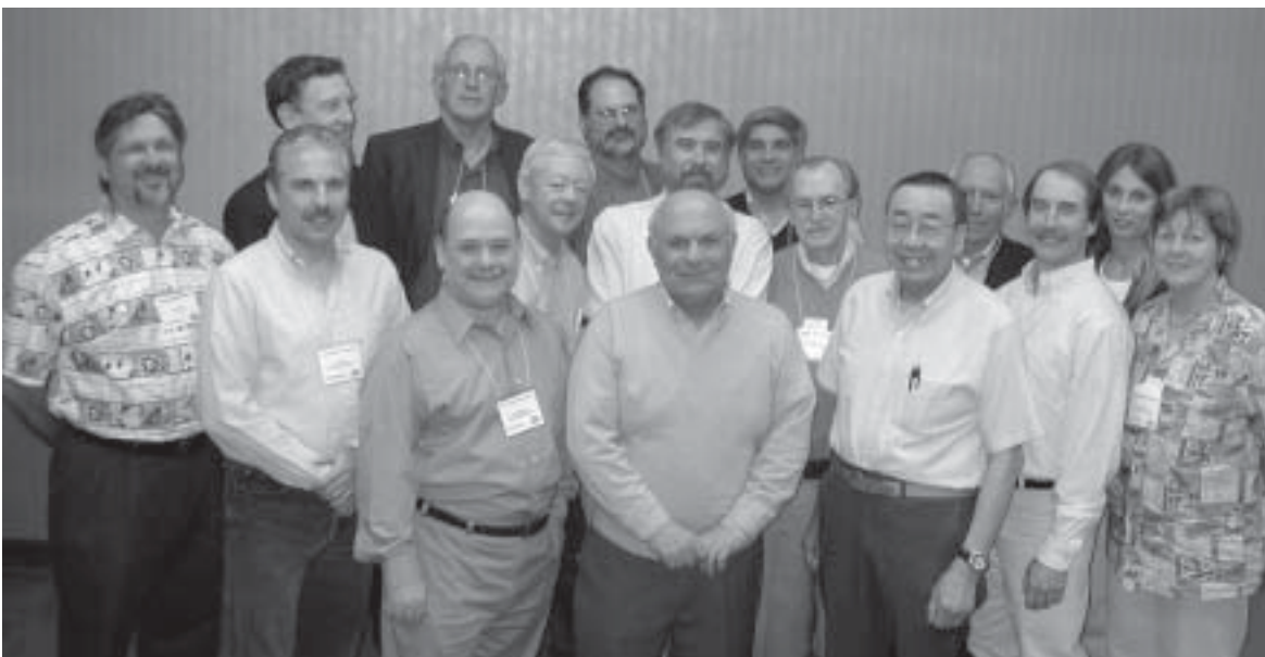
The Past-Presidents of the NSA gathered together for luncheon at the Annual Meeting in Philadelphia.